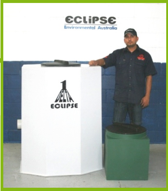
Delta 1 Compact Grease Arrestor with Pump Box