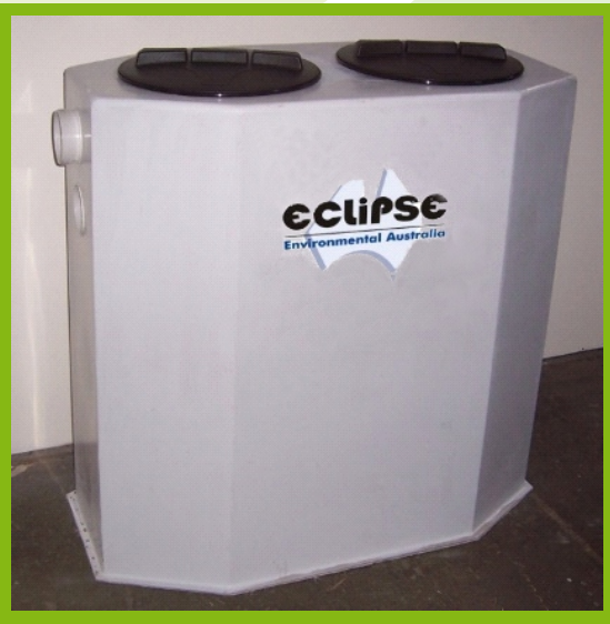
Delta 2 Compact Grease Arrestor