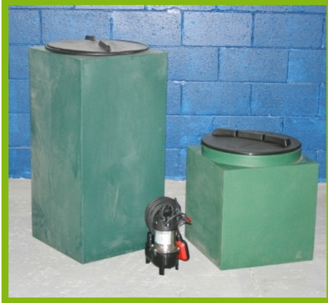
Pump Box and Pump where sewer cannot be accessed by gravity