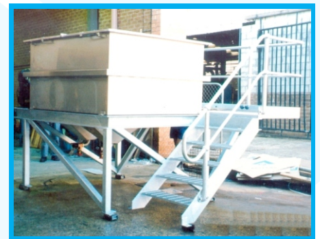
HYD5000 with Gantry