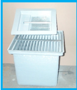
900mm x 900mm Collection Pit with Grate & Filter Basket