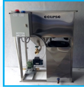
HYD1000 with Built in High Level Alarm and Pump Box