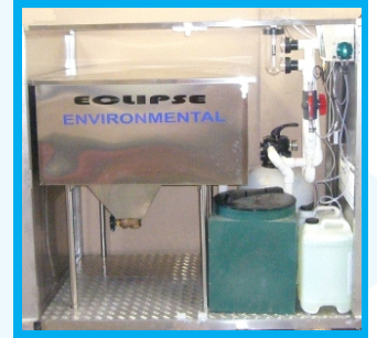
Nova 1 Self Contained Water Recycling System